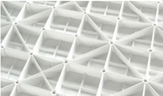
Ribbed underside detail.

Be sure to order a FastDEK installation kit: FB1000-IK.