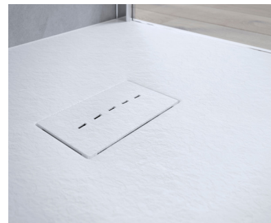
Drain cover detail.