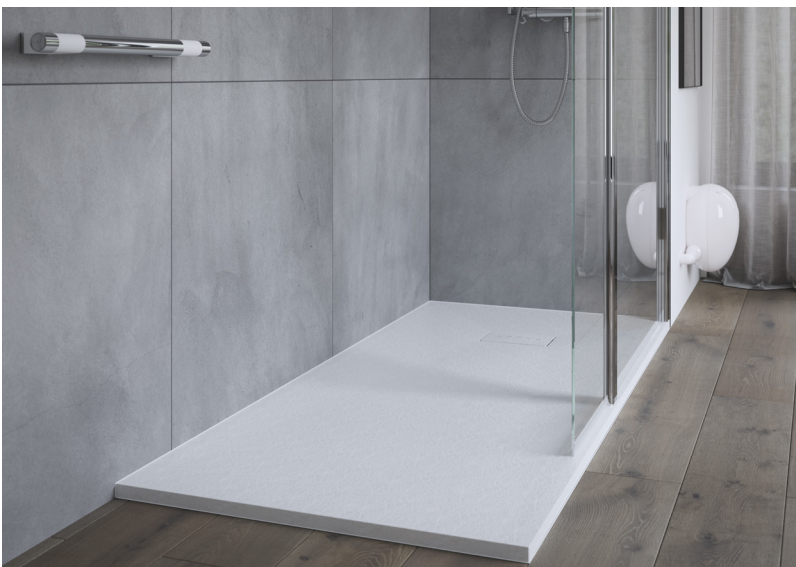
FastDEK installed on finished floor.