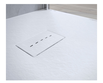
Drain cover detail.