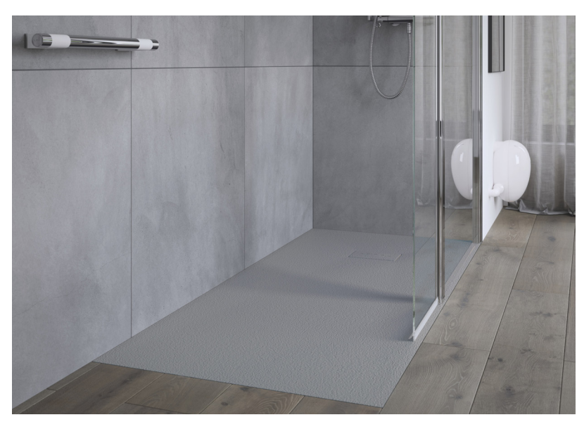
FastDEK installed on finished floor.