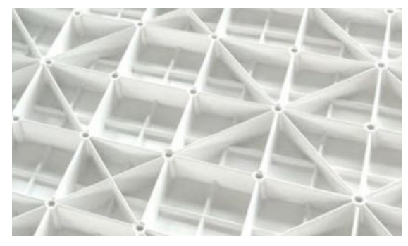
Ribbed underside detail.