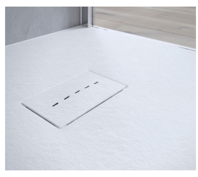
Drain cover detail.