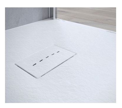
Drain cover detail.