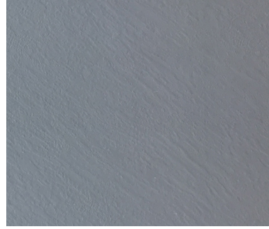
Color and surface texture detail.