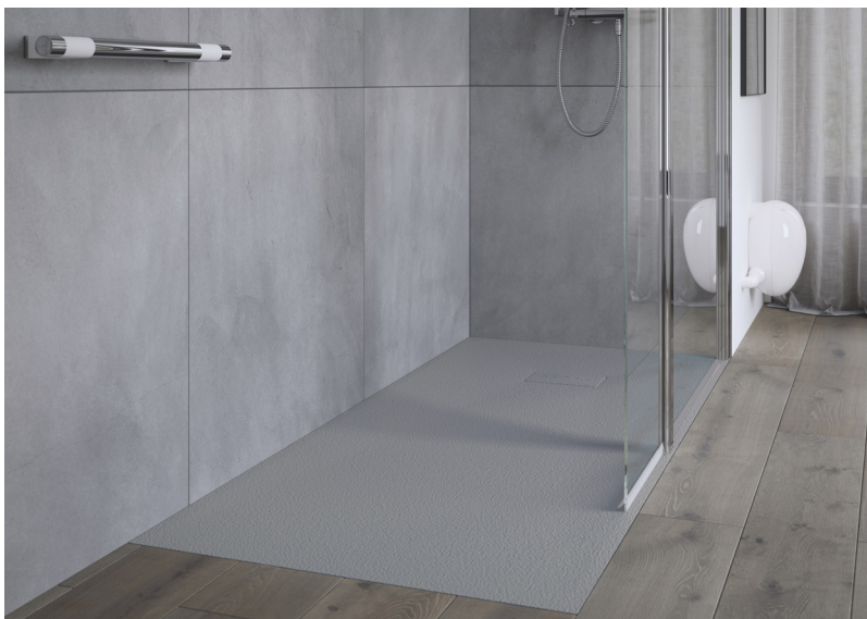
FastDEK installed on finished floor.