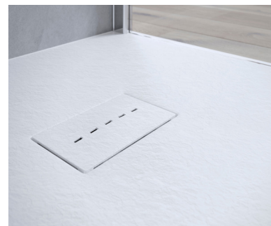
Drain cover detail.