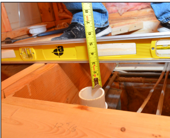
Prepare for a drain connection by cutting the drain pipe below the shower base's support structure: 27/8" for gray drain assemblies; 21/2" for white drain assemblies.

For drain connector specifications, please see item code DC5500-PVC.