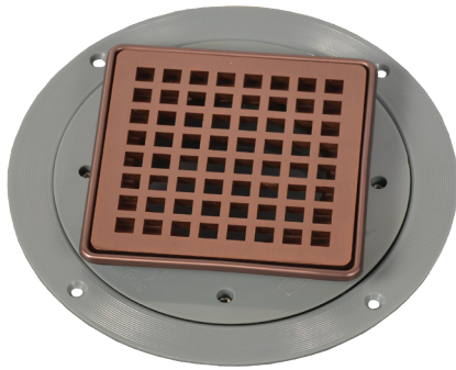
Grid Pattern Drain for Tile