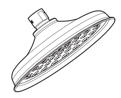
Single Function Rainshower