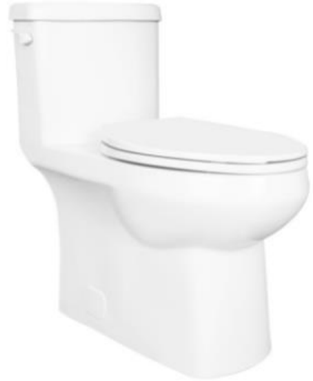
LX S10009 White One-Piece Elongated Toilet